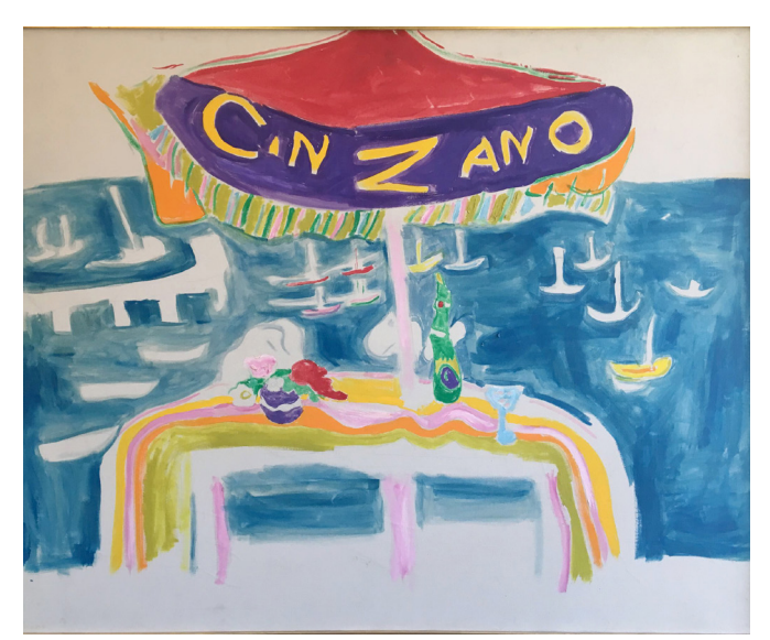
Cinzano (Provincetown), Oil on linen, 37 1/2 x 45 1/2 in

"Bob loved to paint, we found paintings behind the dresser, the kitchen cabinets, and in the closet; we even found paintings stretched over other paintings!" - Glenn Macura