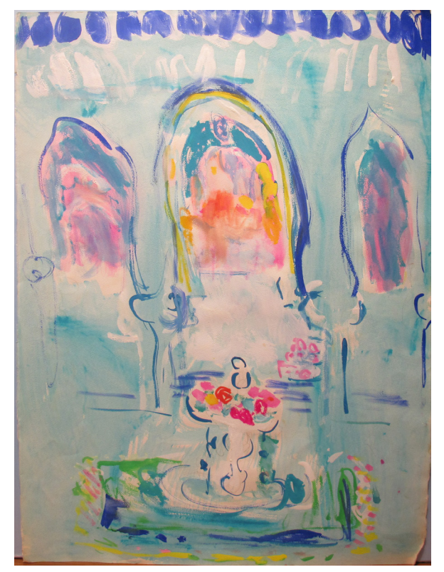
Moroccan Fountain WC on paper, 30 x 22 in