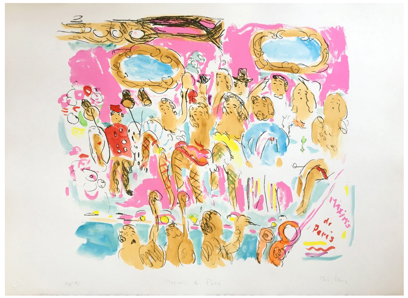
Maxim's de Paris