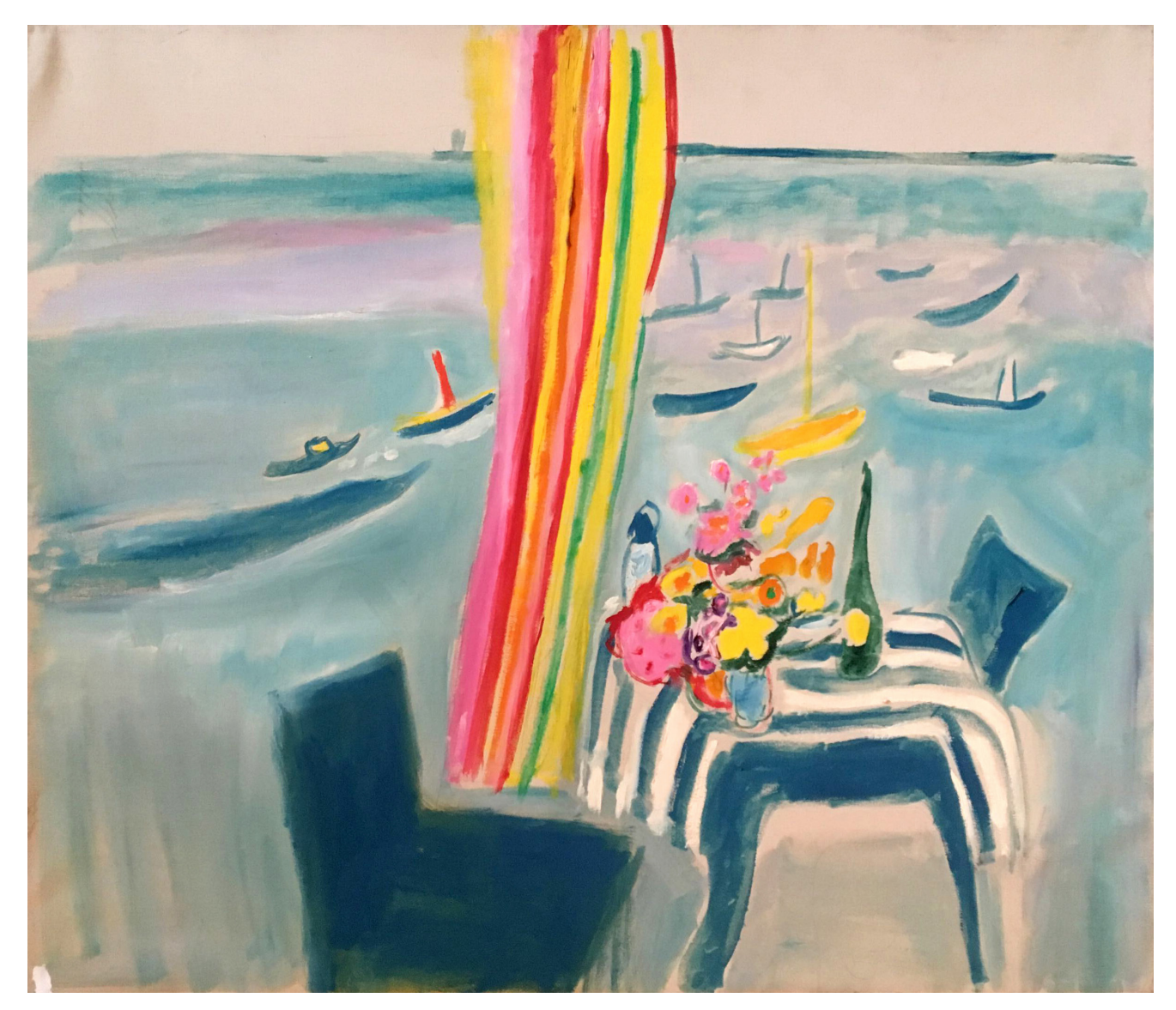
Terrace Positano , 2002