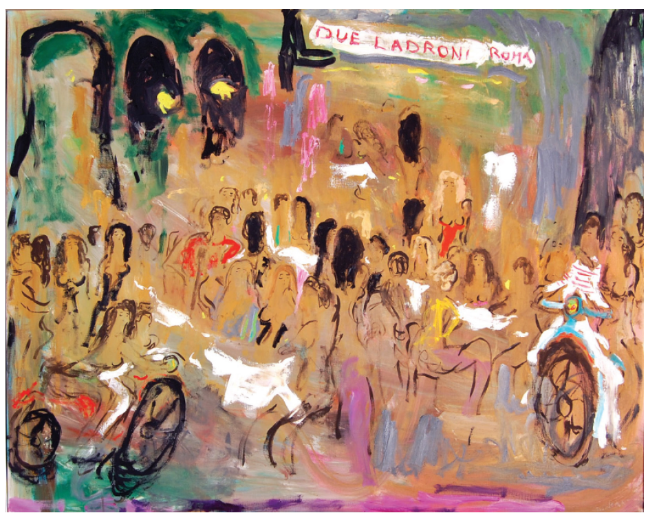
Restaurant of Two Thieves