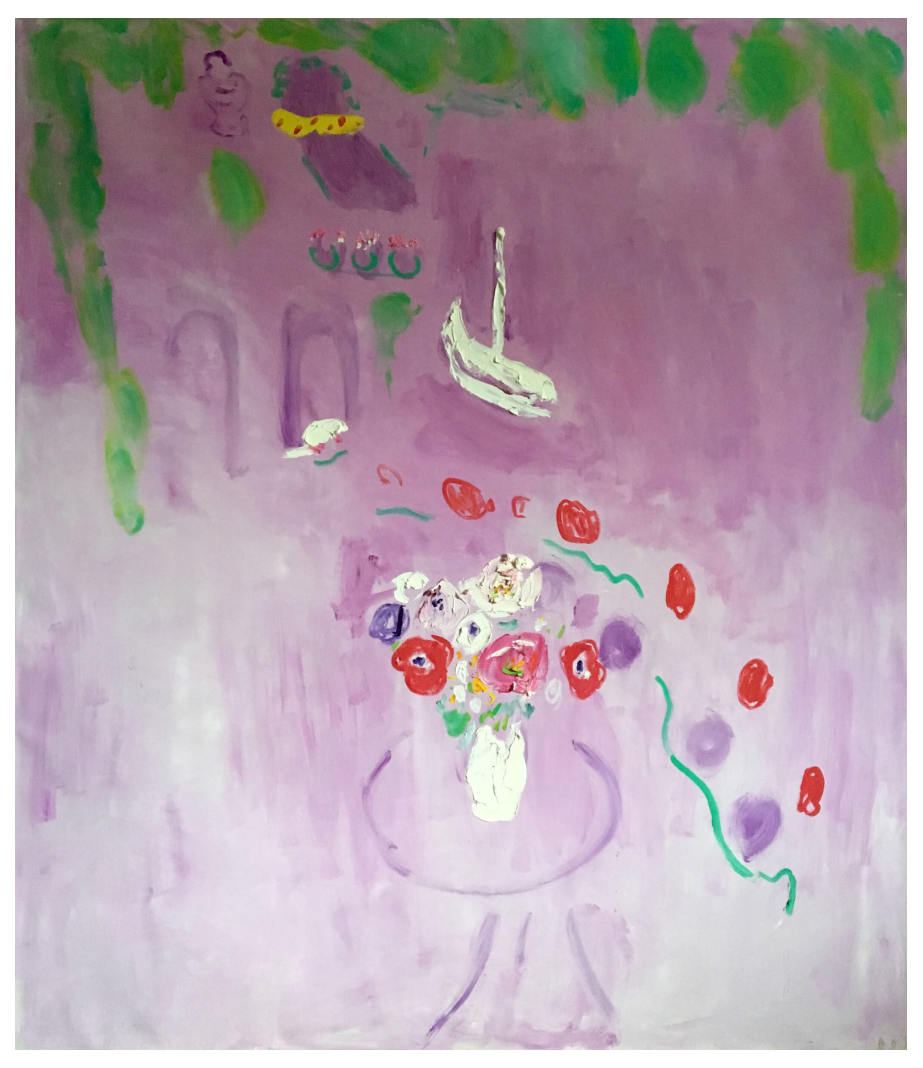
Villa L'Incanto (The Enchanted) Positano II, Oil on linen, 57 3/4 x 50 in