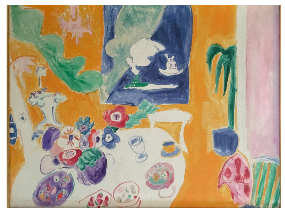
Untitled #2 (Strawberries & Anemones) Oil on linen, 21 x 27 in